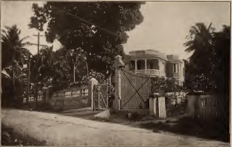
A PORTO RICAN HOME, SANTURCE, P. R.

It was a sign of good things to come when four great missionary boards,